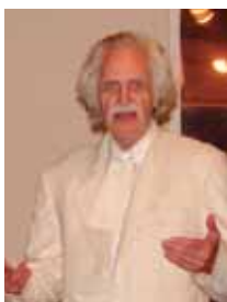
A visit from Mark Twain

This year's Open Mic Night was the best one yet! Start planning your act for next year – the bar has been set high for laughs, poignancy, and true talent. Here are a few shots of some of the fabulous performers from the March 21 event: