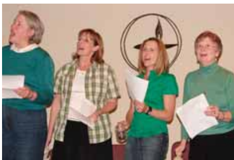
"Belly Up to the Bar"